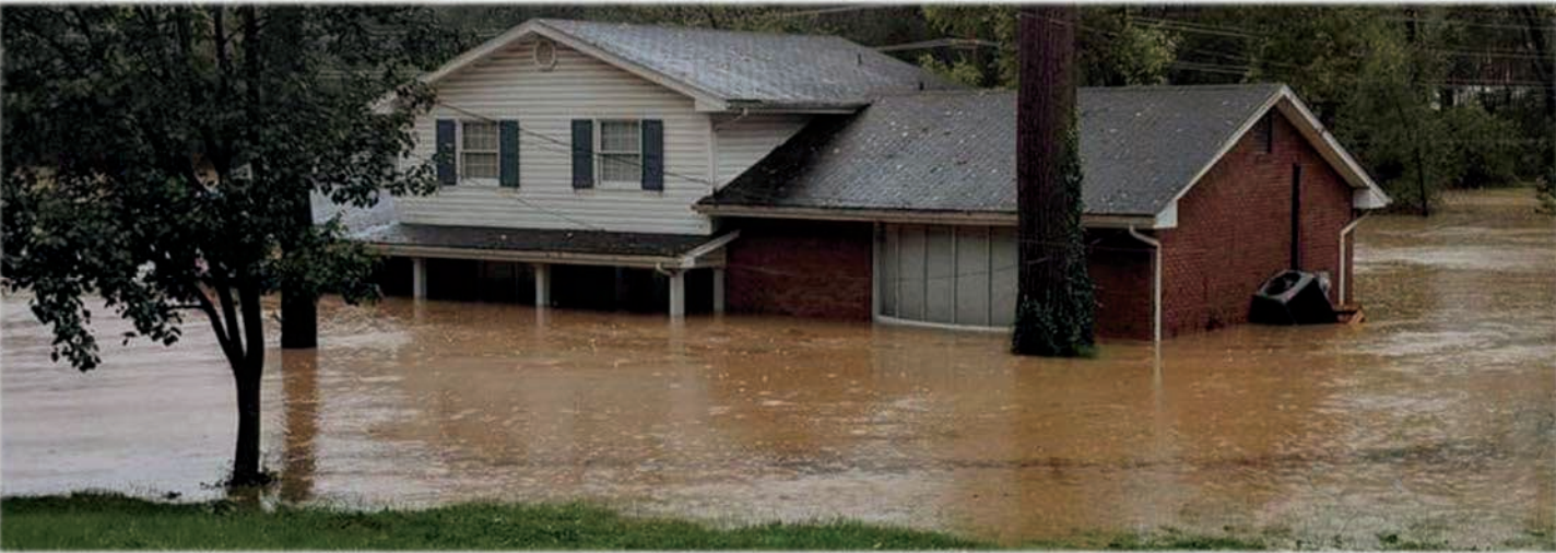
Serious flooding occurred across Roanoke County during the remnants of Hurricane Michael.