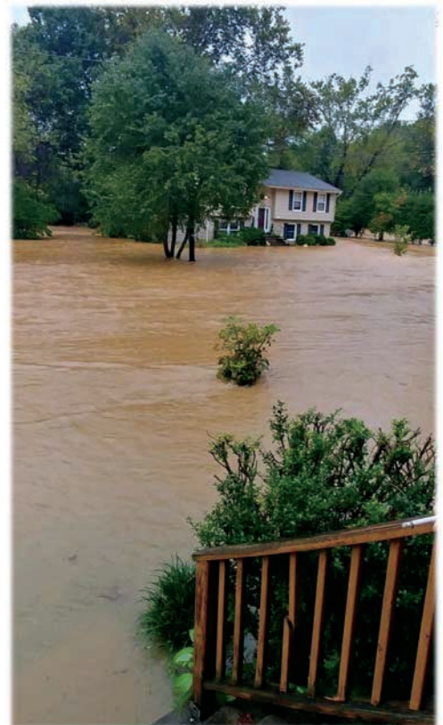
Planning for a disaster is the best way to survive it.