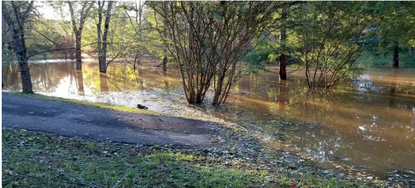
Do not drive into flooded roadways or around barricades. Turn around and go another way! Most cars can be swept away by less than one foot of moving water.

For more information, visit https://roanokecountyva.gov/flooding . ■