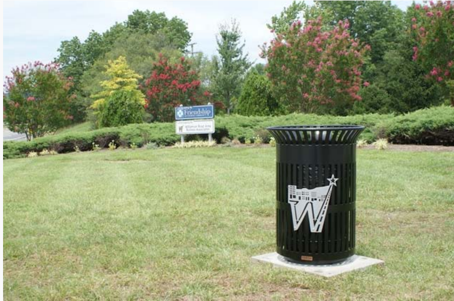
New landscaping, recognition sign and trash can at the Williamson Road/Plantation Road intersection (northeast side)

The two triangles located at the north end of Plantation Road at the Interstate 81 northbound ramps are available for sponsorship as well. Please contact County staff if your business is interested in completing and maintaining a similar landscaping project.