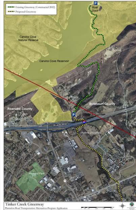
Tinker Creek Greenway Map (Click for larger PDF)