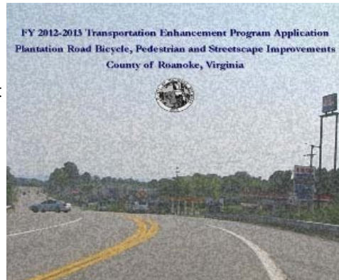
2011 Plantation Application (click to view)

The project website includes the entire 2011 application, the 2011 presentation and the 2009 application.