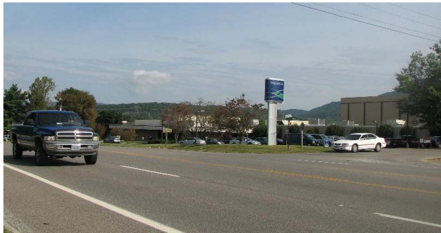
Plantation Road and Lila Drive Intersection, 2009

Several indicators at the Lila Drive intersection including traffic signal warrants, crash data and sight distance issues have led to a change in the project scope. VDOT has agreed that a traffic signal with pedestrian accommodations is needed at Lila Drive and that it can be physically installed. The signal must be privately funded, however, since Lila Drive is a private street. Since this new signal will have pedestrian accommodations, the other mid-block crossings at Hitech Road and at Walrond Drive have been removed from the Plantation Road concept plan.