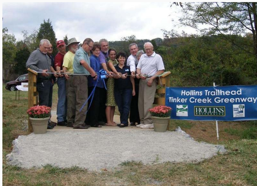
Hollins Greenway Ribbon Cutting Ceremony, October, 2012

A ribbon cutting ceremony was held on October 6, 2012, to open a new 2.5-