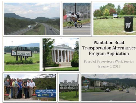
2013 Plantation Presentation (click to view)

View a presentation on the Plantation Road Transportation Alternatives Program Application which summarizes the current request and progress made since the 2011 application submission.